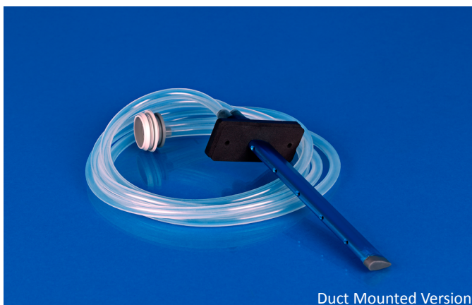
Duct Mounted Version

For a 4-20mA control signal, remove the resistor between terminals 2 and 3.